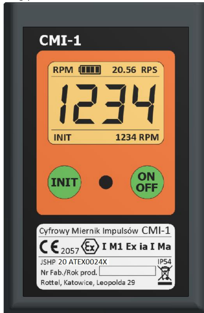
Fig. No. 3. View of LCD display -CMI- digital impulse meter1

A magnetic probe is connected to the connector at the top of the device, which controls the pulse counting process.