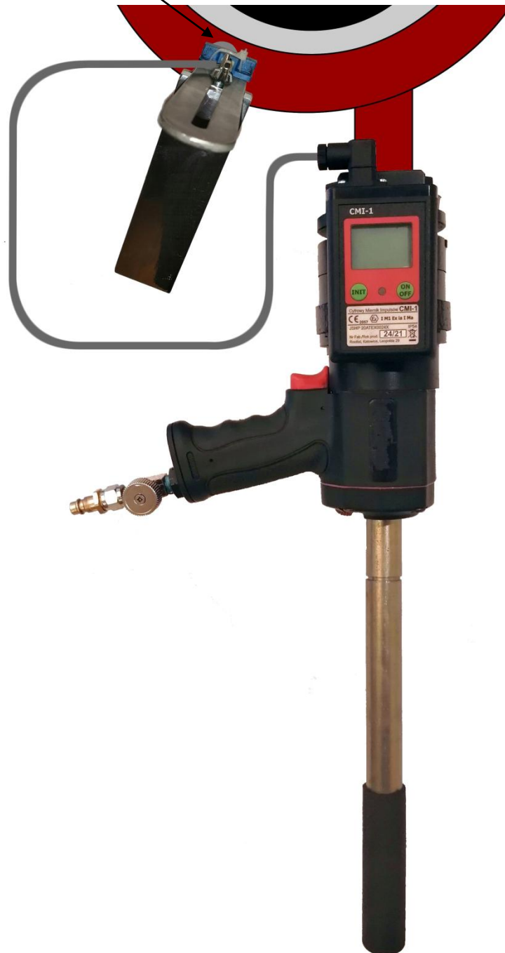
Fig. 2a. CMO-3/S Digital Revolution Meter - magnetic probe positioning in relation to the triggering screw during measurement (head in direct contact with the screw)

Screw indicating activation of centrifugal trigger, during measurement (in polumagnetic)